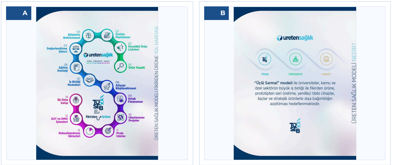
Figure 2. TÜSEB Health Models A) Producing Health Model; B) Triple Helix Model