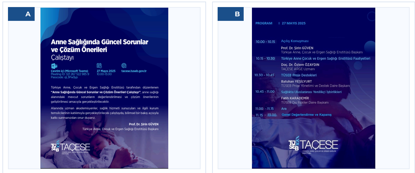
Figure 1. Current Problems and Solution Proposals in Maternal Health Workshop A) Invitation; B) Program

The aim of the workshop program and the invitation of the participants held on Tuesday, May 27, 2025, within the Health Institutes of Türkiye (TÜSEB) Türkiye Maternity, Child and Adolescent Health Institute (TAÇESE); is the planning and development of effective projects and health policies in order to lay the foundations of a healthy society by supporting the physical, mental, and social development of maternal health (Figure 1).